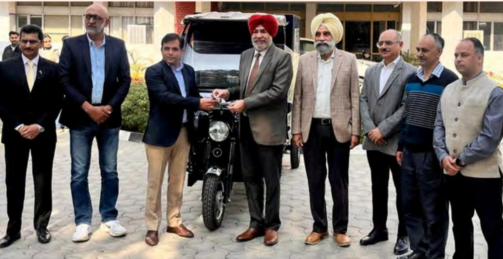
← Introduced e-Vehicles for Pollution Free Environment