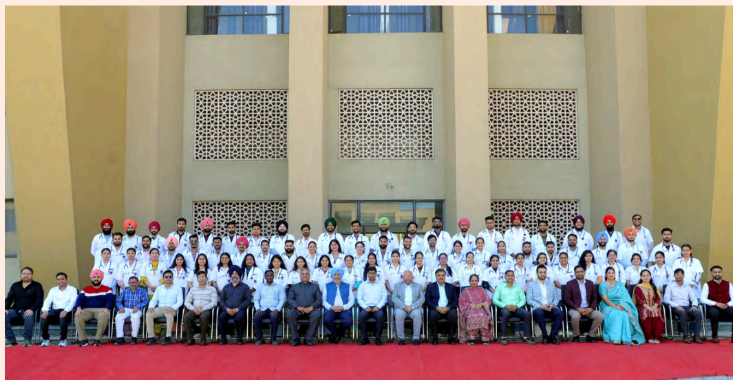
Oath Taking Ceremony

The college also celebrated the graduation of its first batch of B.V.Sc. & A.H. during this year