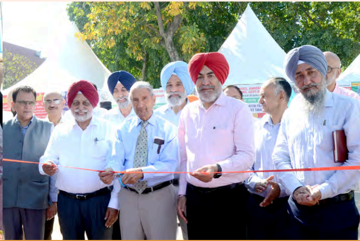
Pashu Palan Mela at Ludhiana - March & September 2025