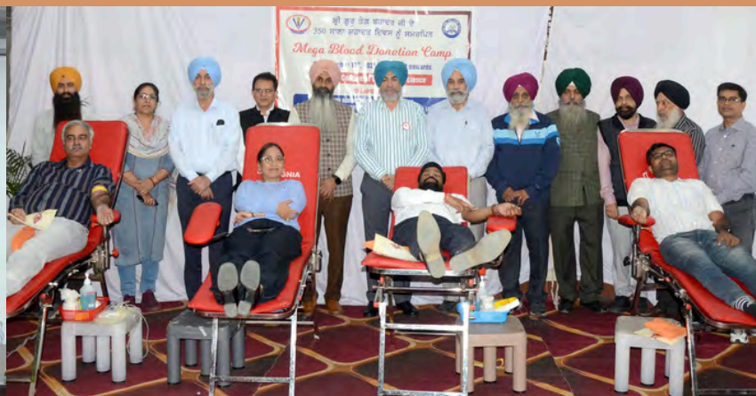
Commemoration of 350 th Martyrdom Day of Sri Guru Tegh Bahadur Ji